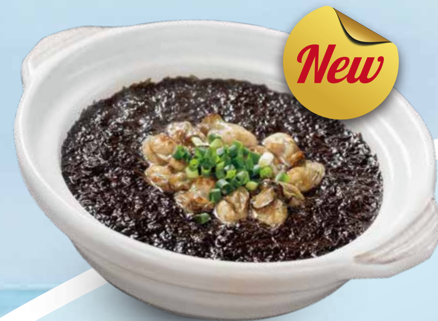
Claypot Oysters with Seaweed 紫菜焖海蛎煲

A comforting pot of ocean goodness. A savoury and umami-packed combination. 一煲浓香海味, 紫菜软滑入味, 海蛎鲜嫩饱满。