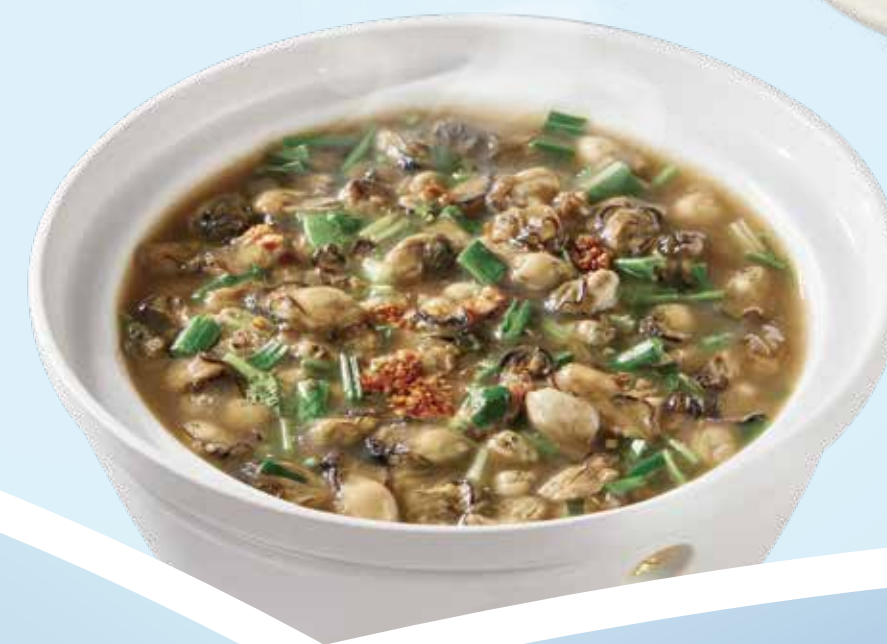
Farmhouse Oyster Soup 农家海蛎汤

Every spoonful is filled with oysters! So fresh! 舀上一勺, 满满海蛎! 好鲜!