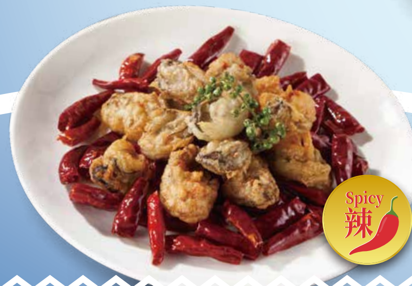
Deep-fried Oysters with Dried Chilli 辣子鲜海蛎

Crispy on the outside, tender on the inside, with a mildly mala kick. 香酥外壳包裹鲜嫩海蛎, 微麻微辣好过瘾。